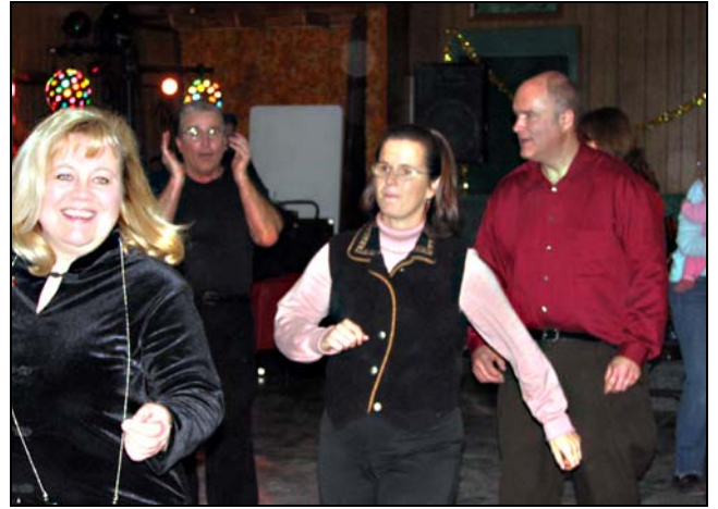
SOLAR strutting their stuff