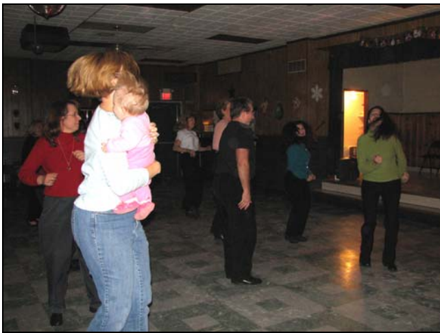
Very young Line Dancer