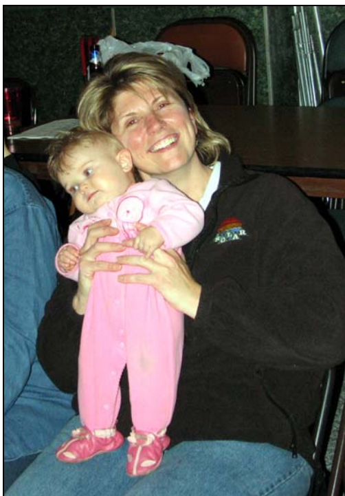
Member to be